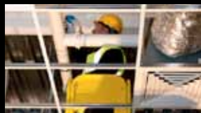
Confined Space Guardrail

The following accessories are available for use with the BoSS X Series: