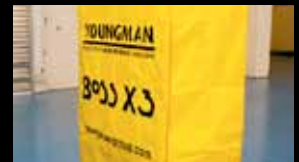
Heavy Duty All Weather Cover