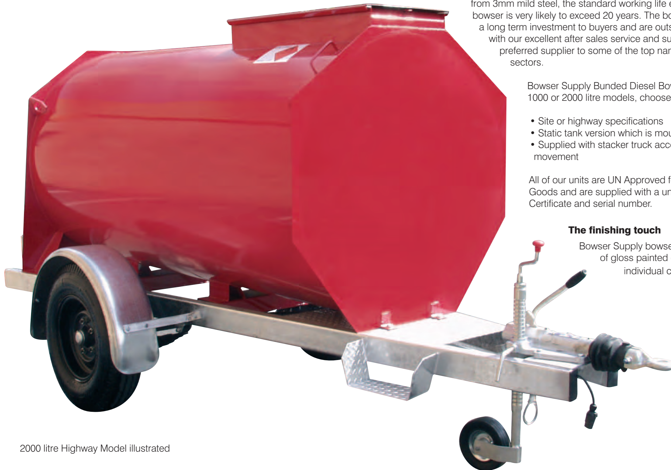
2000 litre Highway Model illustrated

Bowser Supply bowsers can be finished in a choice of gloss painted colours to compliment your individual corporate identity.